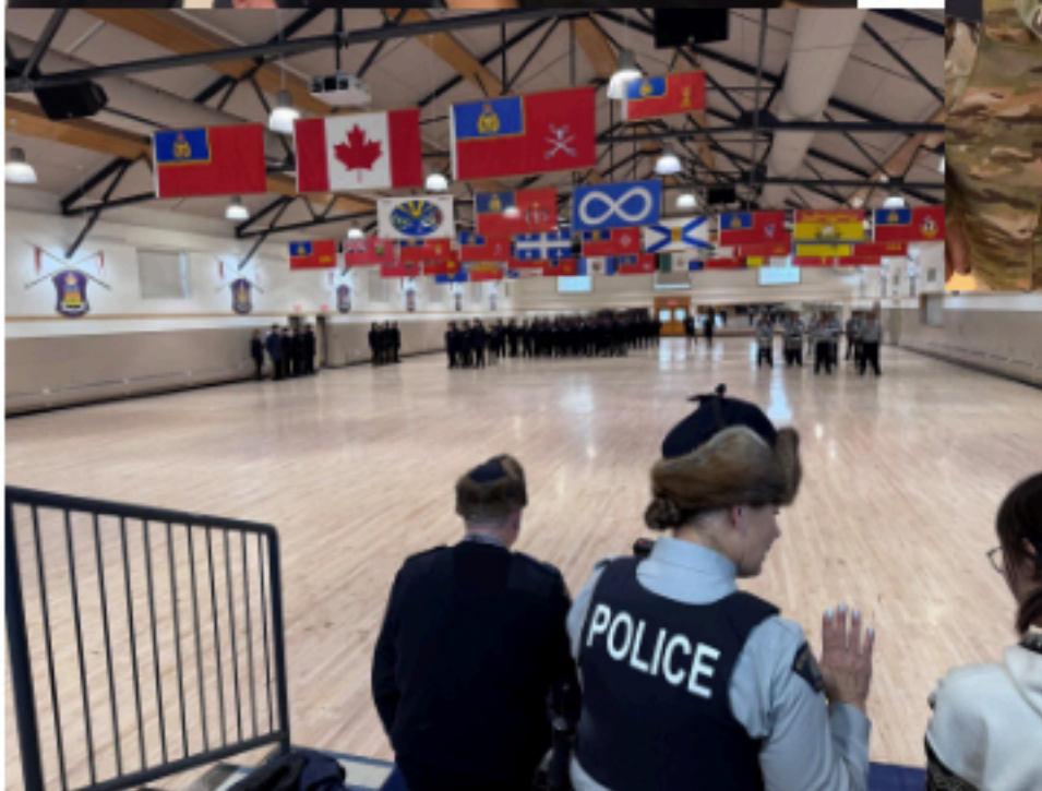
Above: Pasqua cadets at Sgt. Major's Noon Parade.

"RESPECT YOURSELF, RESPECT EACH OTHER, RESPECT YOUR COMMUNITY"