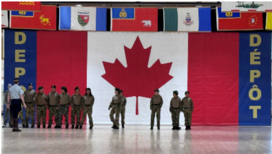
Left: Big River Cadets lining up at the Drill Hall about to learn from Depot Drill & Department Unit.

We are heading to RCMP Depot Division in Regina on August 15-16 for two days of drill, leadership and community building. Selected cadet leaders will get hands-on training to bring structure, pride and confidence back to their programs. This is more than just drill-this is about building future leaders from the ground up. Inquire at jonathan.iron@rcmp-grc.gc.ca for more information.