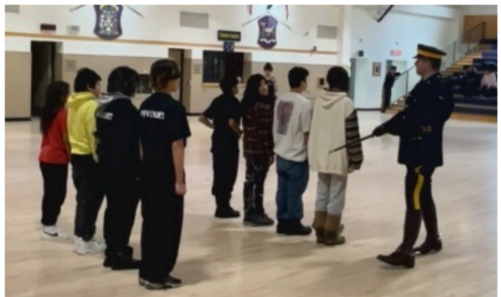
Right: Pasqua Cadets at the Drill Hall about to march with instruction from Depot Drill & Department Unit.

"RESPECT YOURSELF, RESPECT EACH OTHER, RESPECT YOUR COMMUNITY"