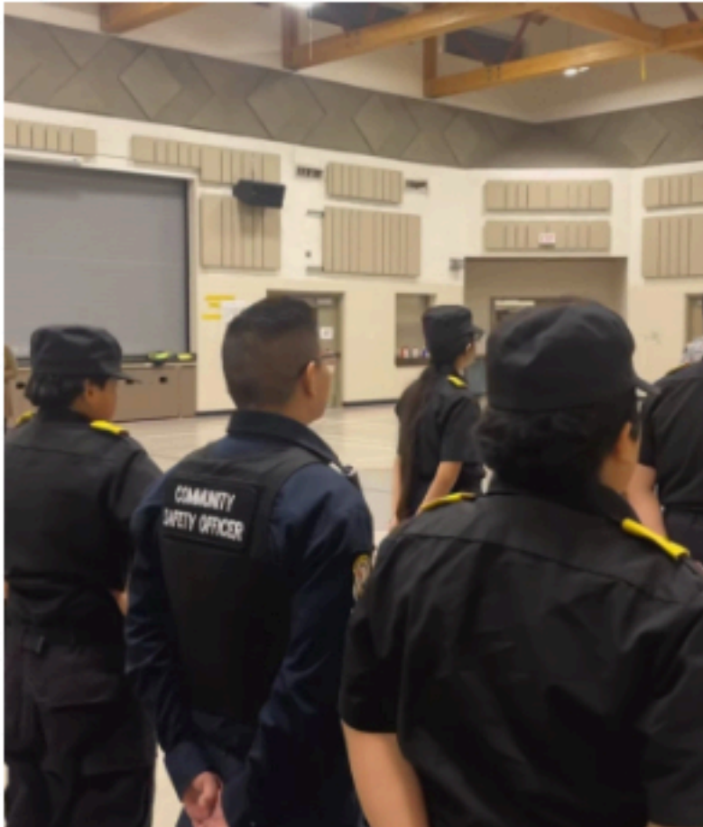
Left: Whitecap CSO takes part in drill session with cadets.