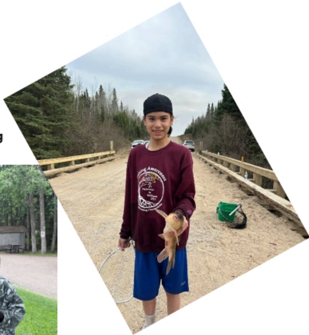
Canoe Lake cadets catching suckers during a cultural outing.