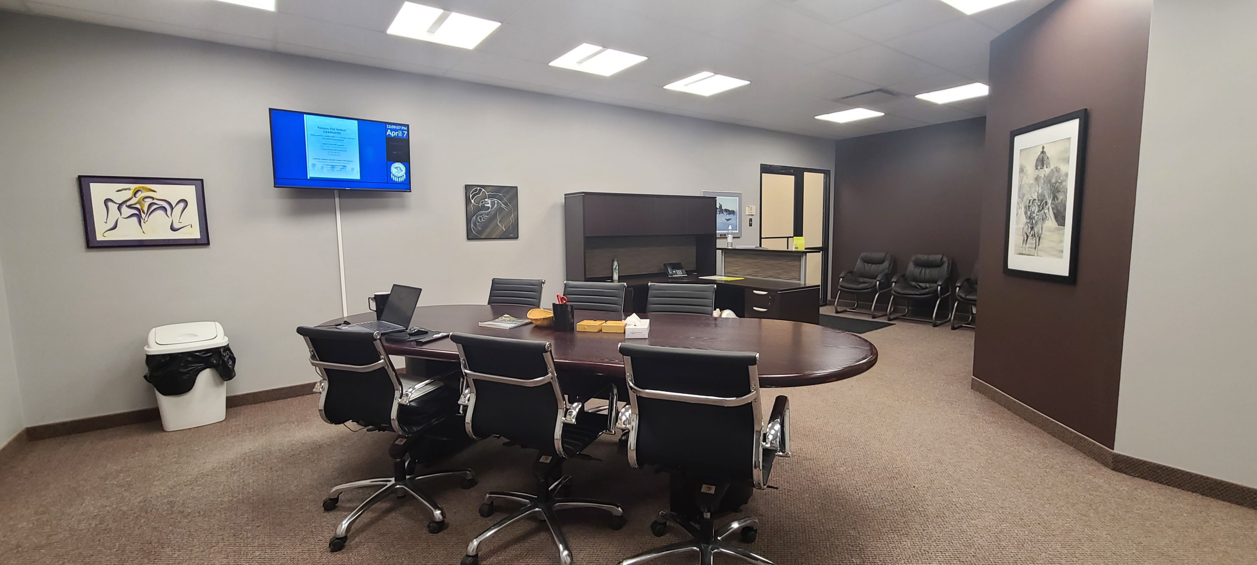
Main Area (Facing entrance)