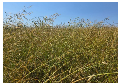
Paskwa Farms canola crop

The first year of operations has already been a success: the farmyard was built, crops were seeded and harvested, and a profit was made.