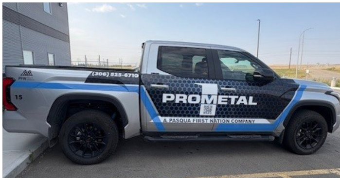
Picture: Pro Metal Industries Ltd Truck