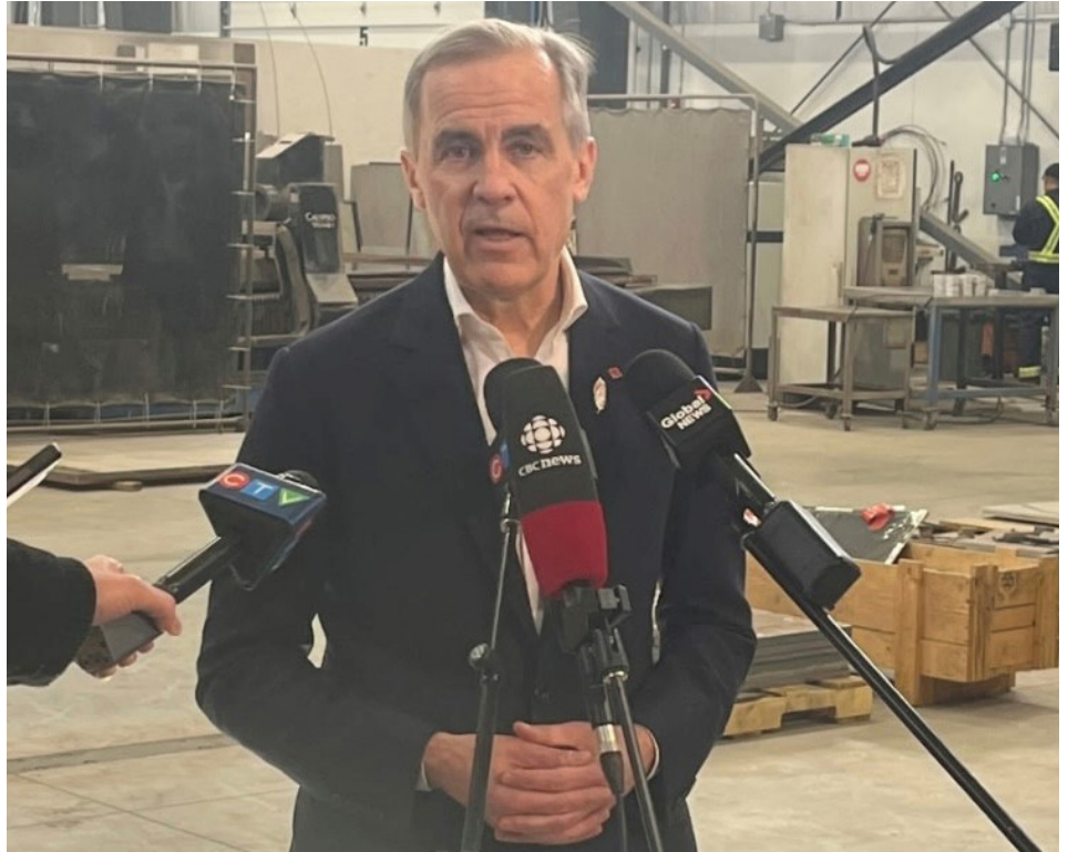
Prime Minister Mark Carney

Canada has just announced the largest defense spending since World War two and remains committed to meet NATO's GDP defense spending targets.