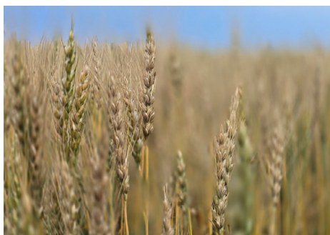
Paskwa Farms wheat crop