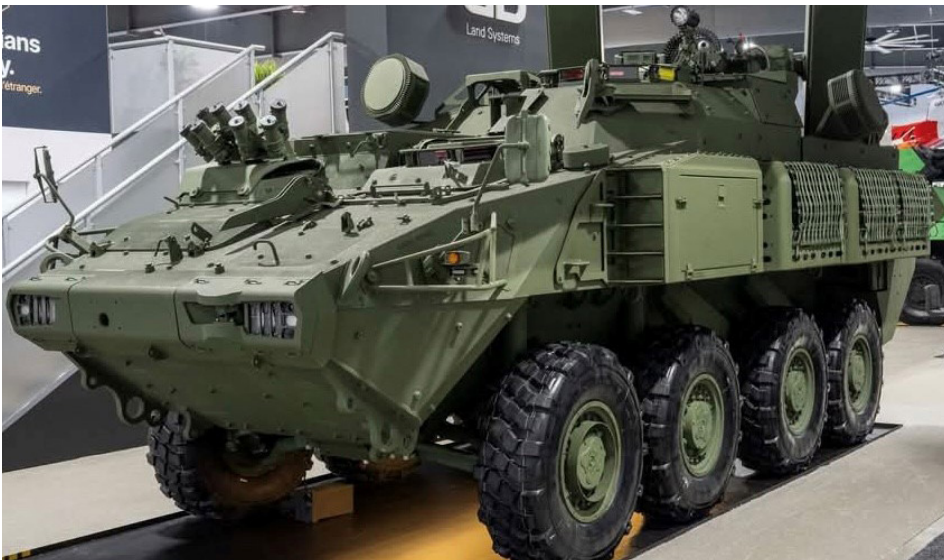
Photo was taken at the Best Defence Conference in London, Ontario