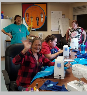
Pasqua ladies in Ribbon Skirt Class