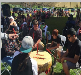
Pasqua Drum Group per- forming at Moose Jaw Pow Pow, June 10, 2017