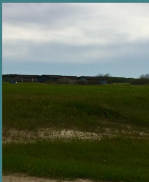
Completed units waiting to be moved to new site.

“Whatever good things we build end up building us ”