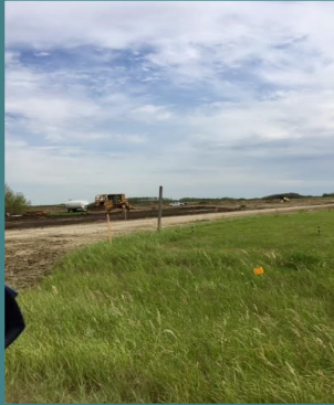
Site of new Pasqua's Sub-Division. 8 new units will be moved to this site once preparations are completed.

“Whatever good things we build end up building us ”