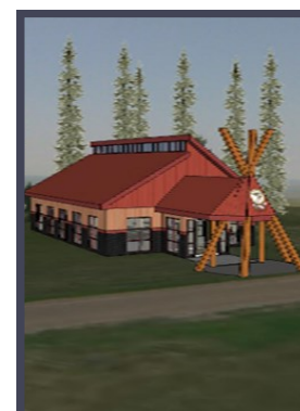
Conceptual Plan of Youth Centre