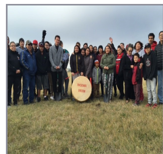
Youth Centre Sod-Turning Ceremony, Oct.

Now we need ideas, plans, etc. from the members as to programs they want to see there for their children and youth. I understand that the youth committee will be surveying the band membership as to some programming that will happen. We know that we are going to put on programs such as traditional dance, regalia making, ribbon skirts and shirts, language classes as this was what was put in the proposal. We realize that there are much traditional losses that we have endured and we need to relearn this knowledge from our elders and others, things such as making pemmican, tanning hides and also cooking traditional foods. We hope that all band members both on reserve and urban centers get involved in this new endeavor. Migweetch to all and we hope to see all of you at the grand opening.